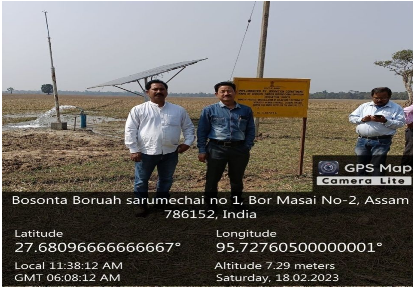
Bosonta Boruah sarumechai no 1, Bor Masai No-2, Assam 786152, India

Latitude Longitude 27.68096666666667° 95.72760500000001° Local 11:38:12 AM Altitude 7.29 meters GMT 06:08:12 AM Saturday, 18.02.2023