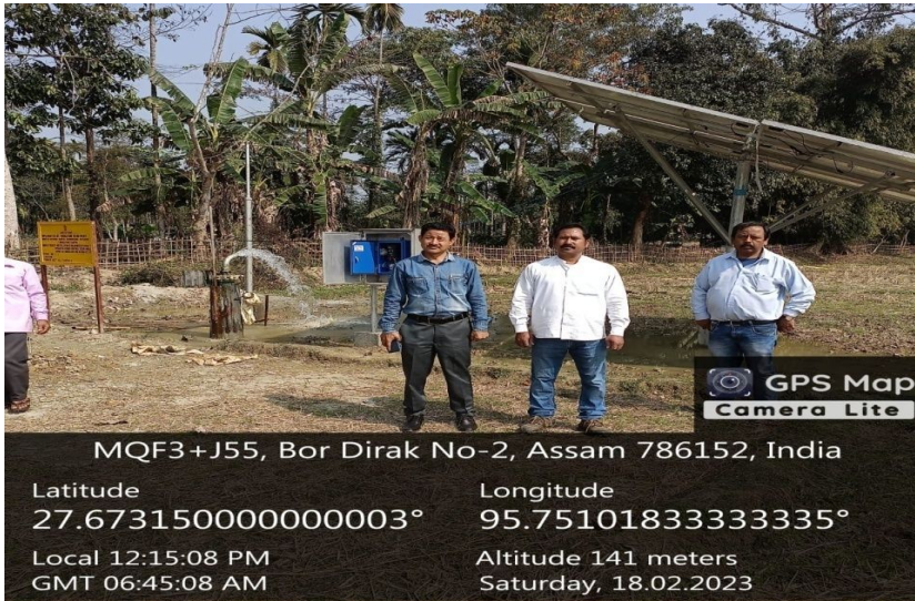
MQF3+J55, Bor Dirak No-2, Assam 786152, India

Latitude Longitude 27.692101666666666° 95.75098000000001° Local 11:57:26 AM Altitude 142 meters GMT 06:27:26 AM Saturday, 18.02.2023