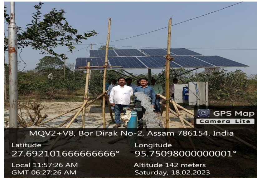
MQV2+V8, Bor Dirak No-2, Assam 786154, India

Latitude Longitude 27.68096666666667° 95.72760500000001° Local 11:38:12 AM Altitude 7.29 meters GMT 06:08:12 AM Saturday, 18.02.2023